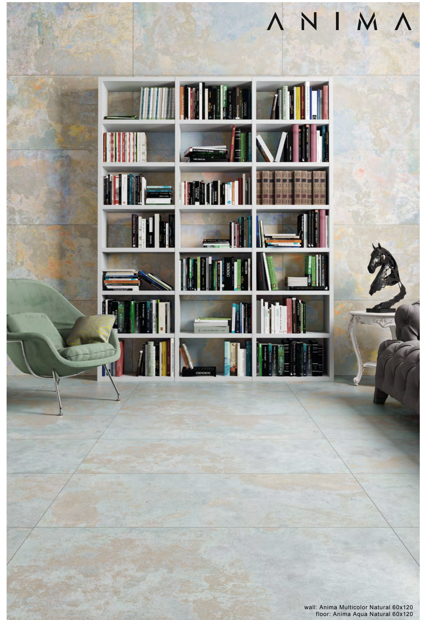
wall: Anima Multicolor Natural 60x120 floor: Anima Aqua Natural 60x120

“Todos somos una única alma que precisa desarrollarse para que el mundo siga adelante y volvamos a encontrarnos.” Paulo Coelho