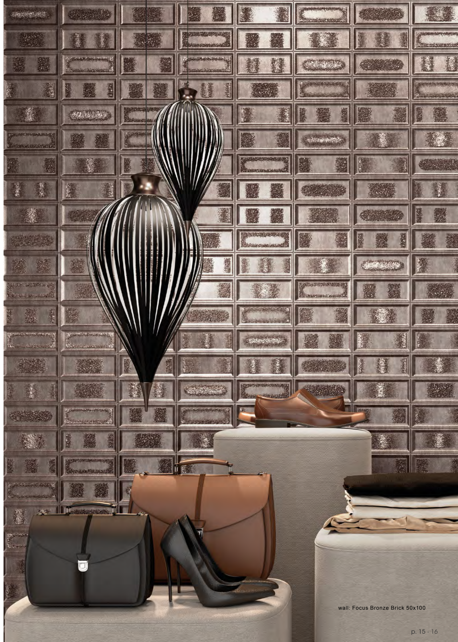
wall: Focus Bronze Brick 50x100

⚠ BRONZE COLOR TO BE CLEANED WITH PH NEUTRAL EL COLOR BRONZE DEBE LIMPIARSE CON PRODUCTOS PH NEUTROS All sizes are rectified and without bevel edge finish. Todos los formatos son rectificadas y no biselados. Tiles with random shade and aspect variation. Producto con alta variación cromática y desentonificación en composiciones.