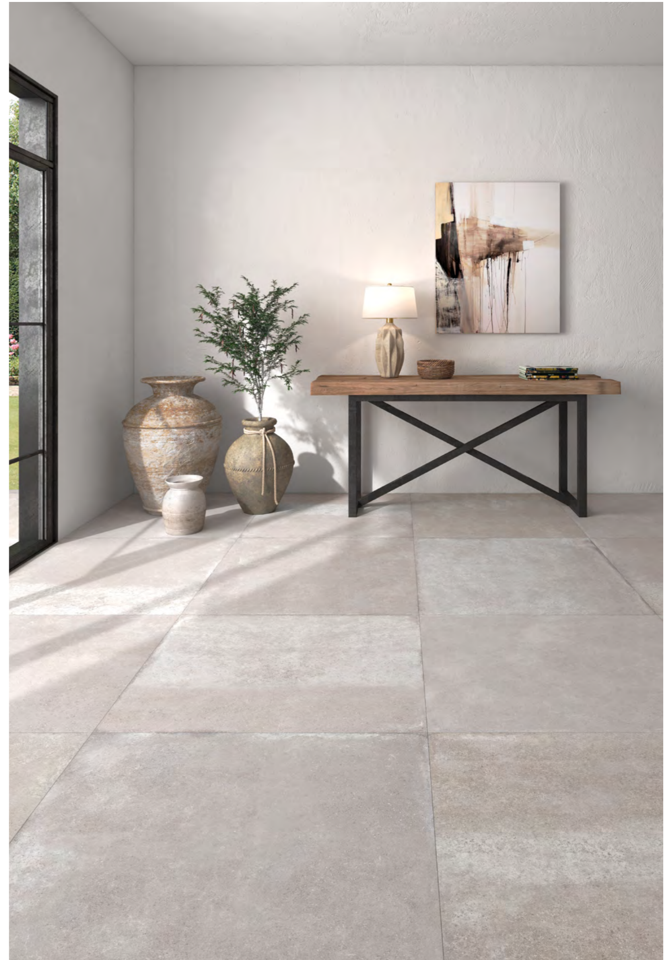
floor: Focus Grey Natural 100x100