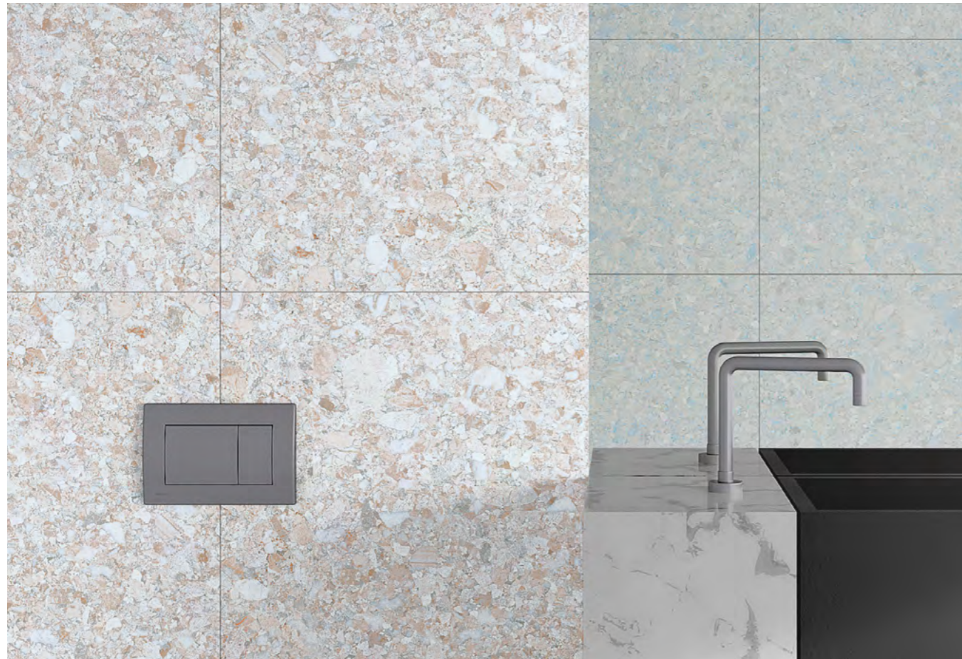
walls: Momentum White Natural 60x60 Momentum Blue Natural 60x60