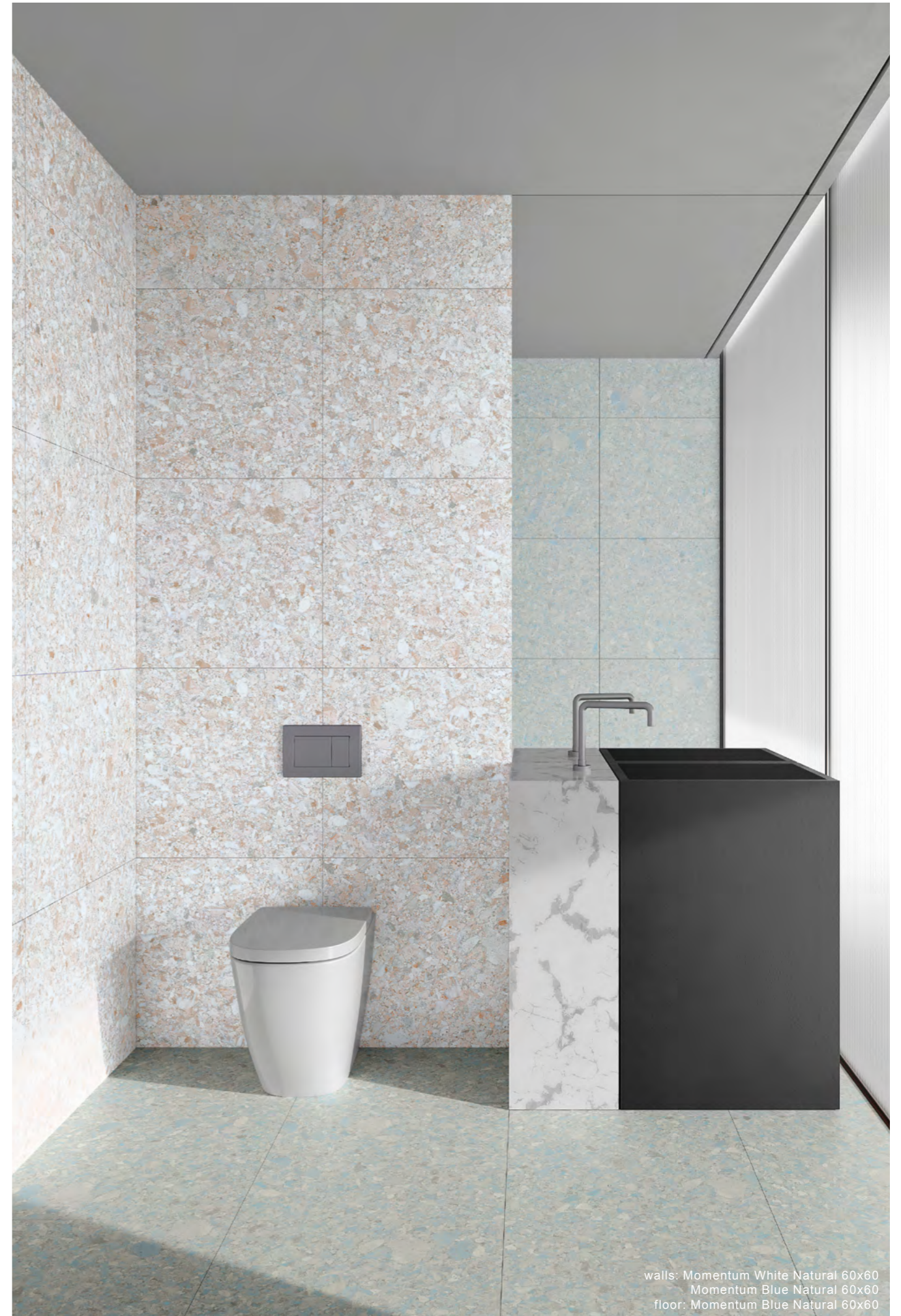
walls: Momentum White Natural 60x60 Momentum Blue Natural 60x60 floor: Momentum Blue Natural 60x60