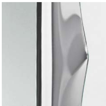
vetro fuso retroargentato back-silvered fused glass