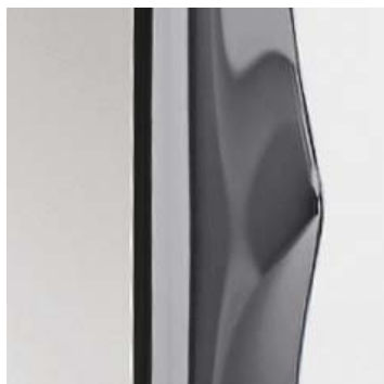
vetro fumé fuso e retroargentato Fused and back-silvered smoked glass