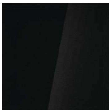
vetro Nero95 Black95 glass

Cubo contenitore Cubic inner compartment