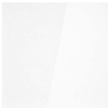
vetro extralight extralight glass

Cubo contenitore Cubic inner compartment