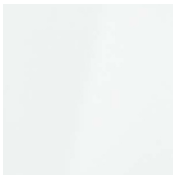
vetro bianco opale opal white glass

Cubo contenitore Cubic inner compartment