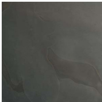
metallo nuvolato cloudy metal